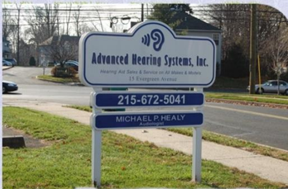
Convenient location in Warminster, PA

COME IN FOR YOUR FREE SCREENING TODAY. Our knowledgeable and dedicated staff will work with you to find a personalized hearing aid solution that will fit your lifestyle.